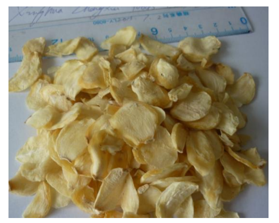
GARLIC GRANULES 8-16