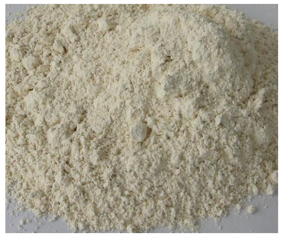
Garlic Powder 100Mesh