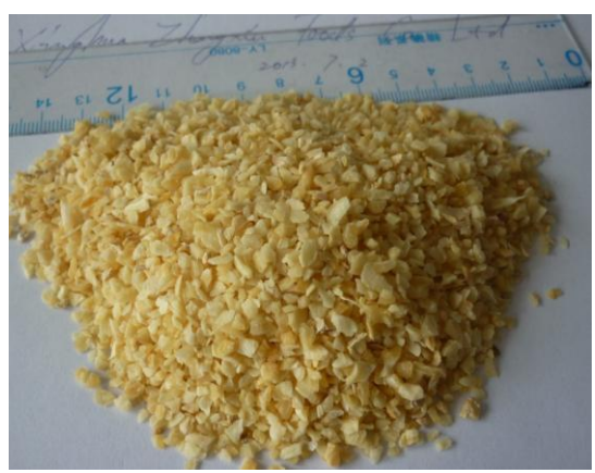
GARLIC GRANULES 16-26