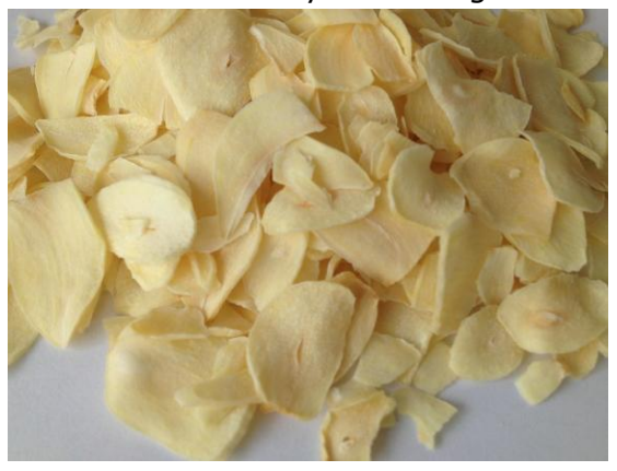
Garlic Flakes without root

Product sector: Dehydrated vegetables and spice