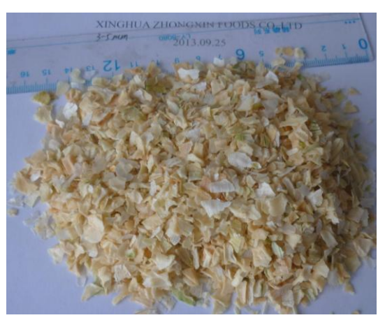
RED BELL PEPPER 3-5MM