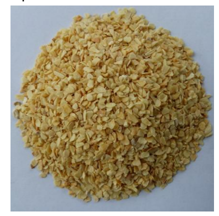
Chopped Garlic 5-8Mesh