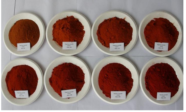
Paprika powder with different ASTA