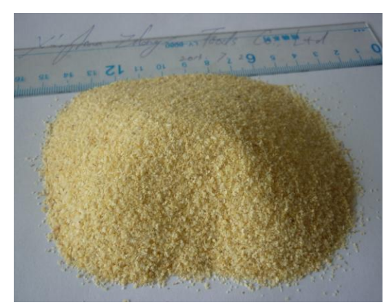
GARLIC GRANULES 40-80