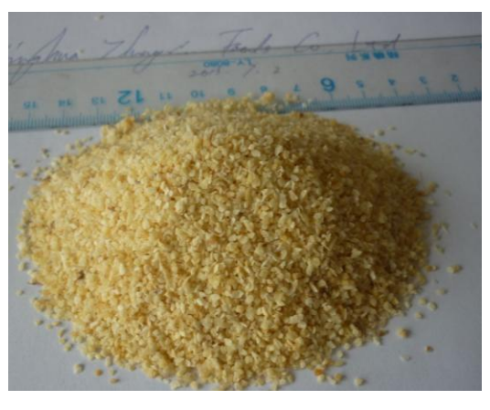
GARLIC GRANULES 26-40