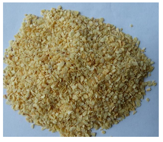
Minced Garlic 8-16Mesh