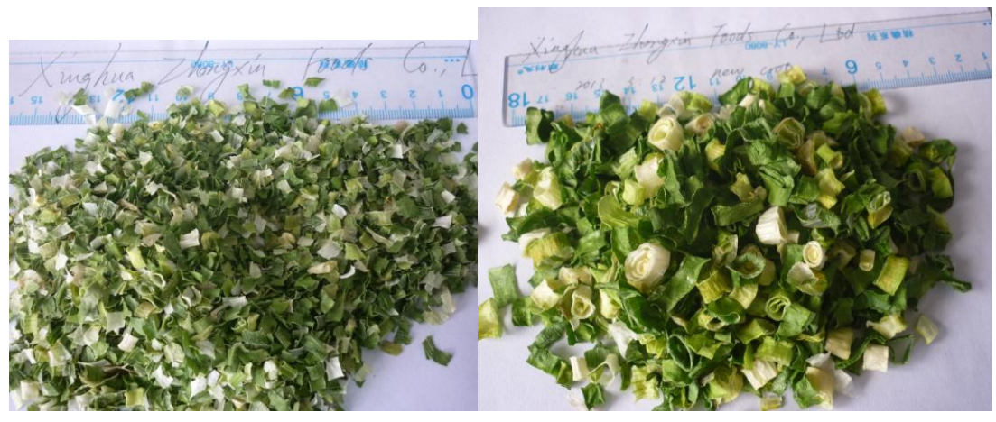
CHIVE ROLLS 5*5