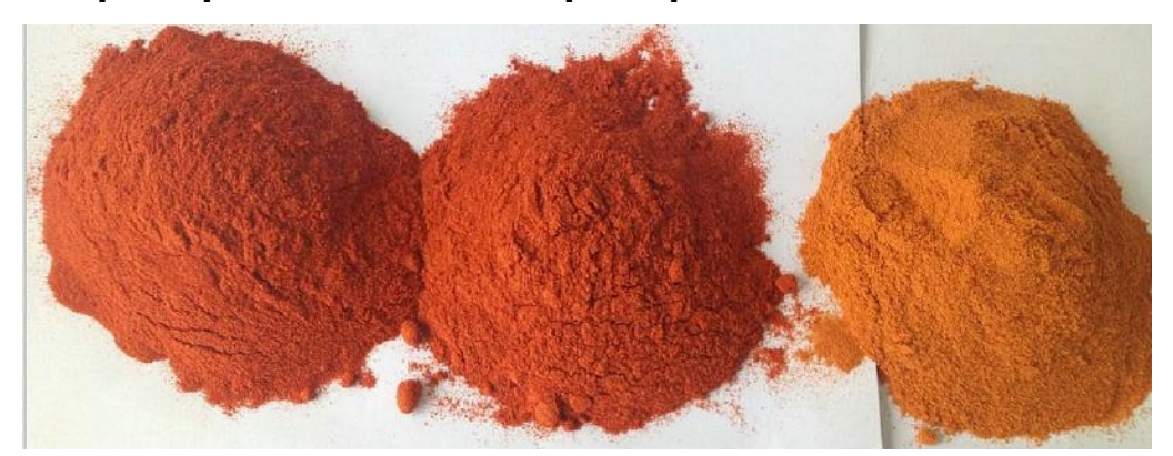
Chili powder with different color and different scoville