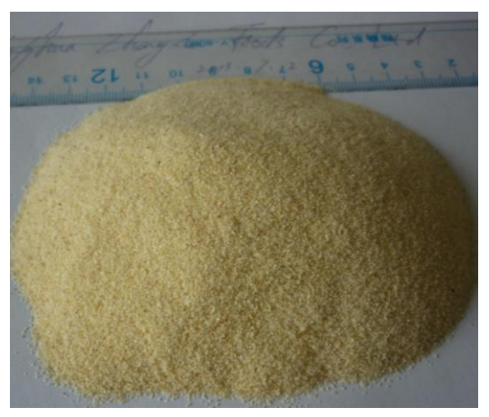
WHITE ONION 10*10 MM