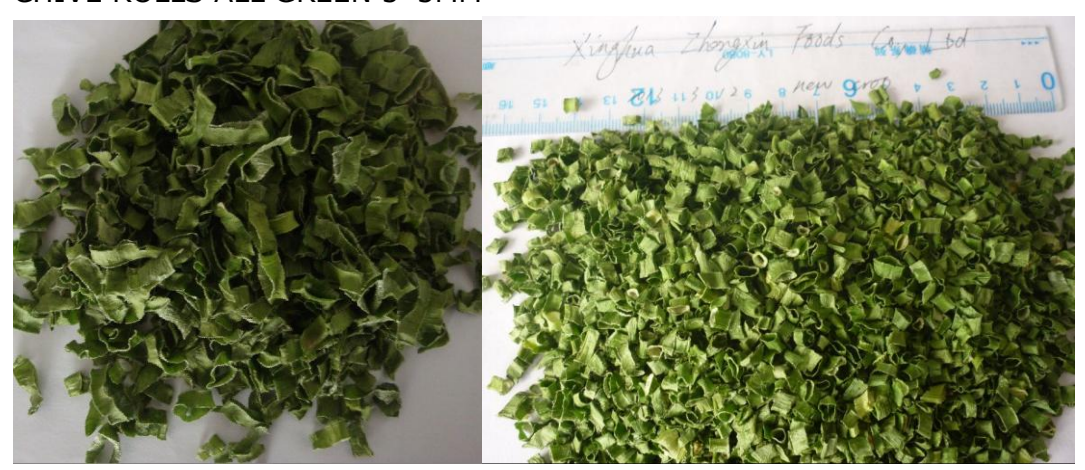
CHIVE ROLLS 3*3