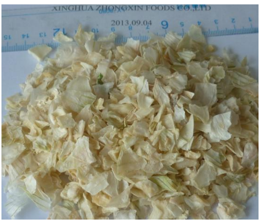
WHITE ONION KIBBLED 1-3 MM