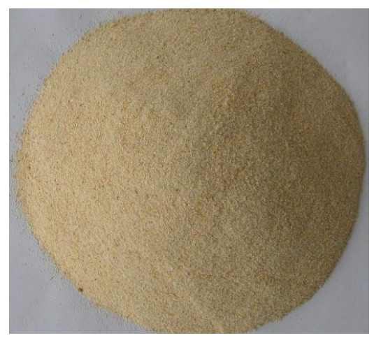
Granulated Garlic 26-40Mesh