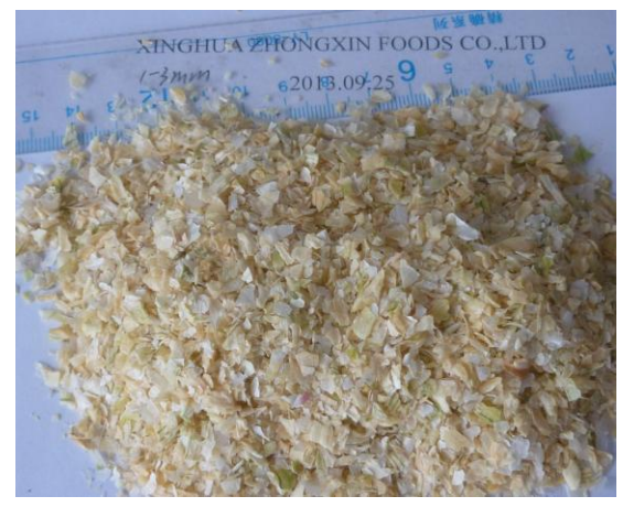
WHITE ONION KIBBLED 3-5MM