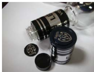
plastic bottle cap