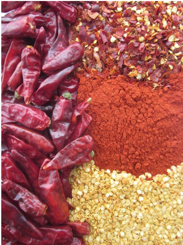
⑤ Dried Sweet Paprika Powder/Crushed/Pods