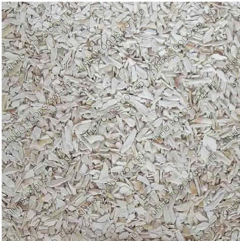
③ Dehydrated Ginger Powder/Granules/Flakes