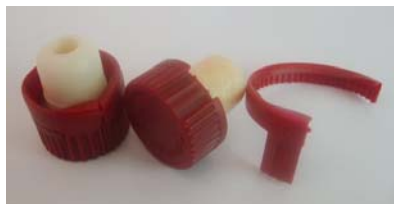
tear off cork