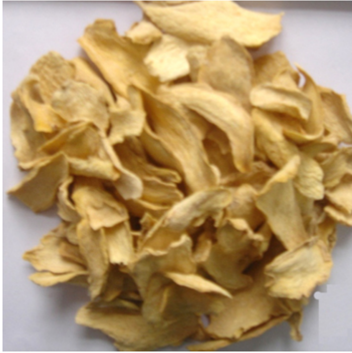
④ Dried Red Chilli Powder/Crushed/Pods