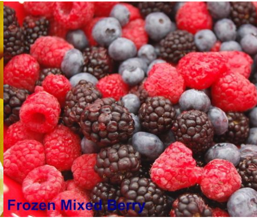
Frozen Mixed Berry