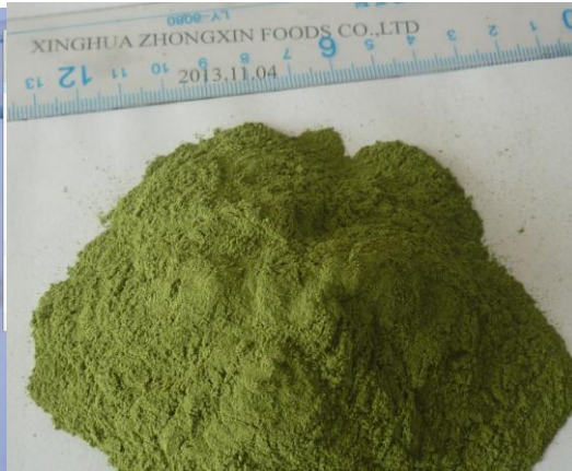
SWEET POTATO CUBES 10*10*10MM