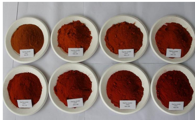
Paprika powder with different ASTA