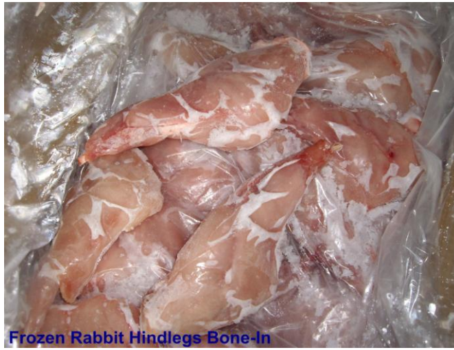
Frozen Rabbit Hindlegs Bone-In