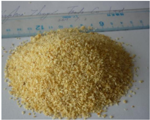
GARLIC GRANULES 26-40