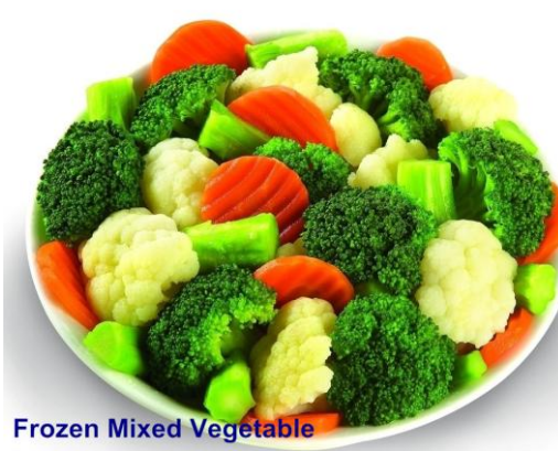
Frozen Mixed Vegetable