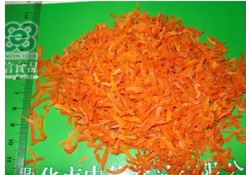
PUMPKIN FLAKES 10*10*2MM