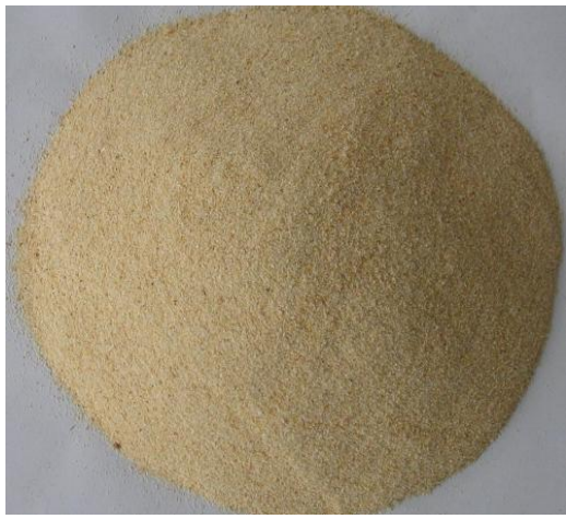
Granulated Garlic 26-40Mesh