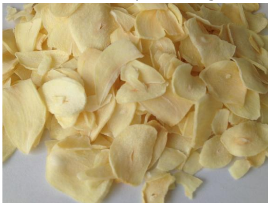
Garlic Flakes without root

Product sector: Dehydrated vegetables and spice