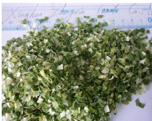
CHIVE ROLLS 5*5