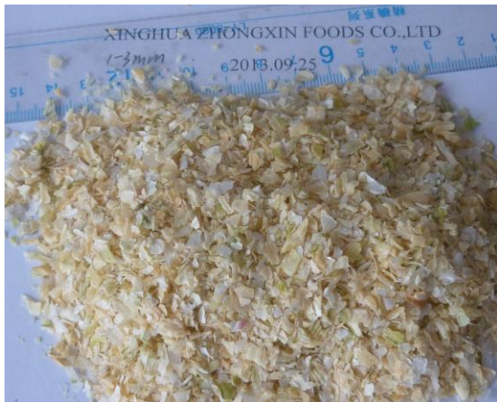
WHITE ONION KIBBLED 3-5MM