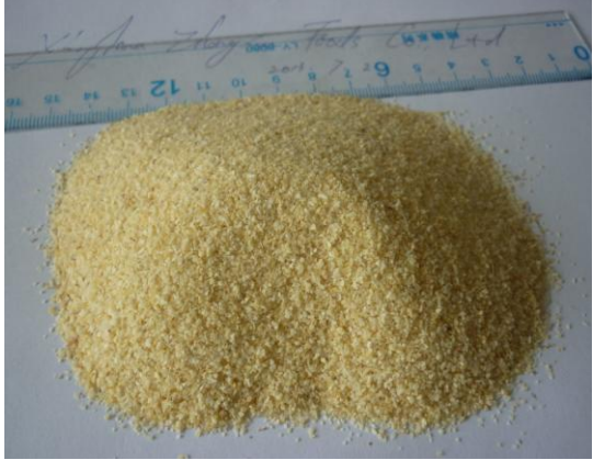
GARLIC GRANULES 40-80