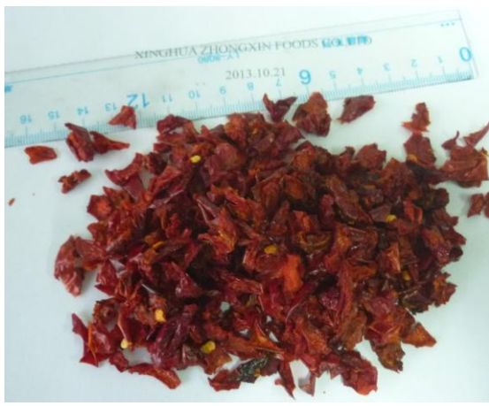
GREEN BELL PEPPER 9*9