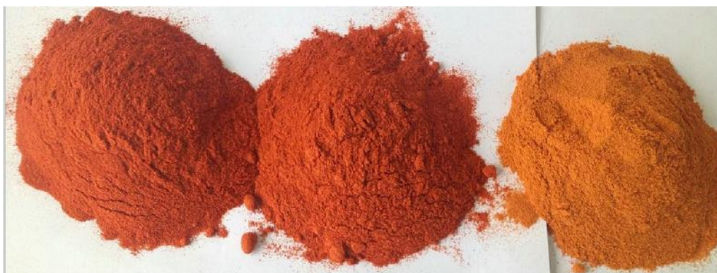
Chili powder with different color and different scoville