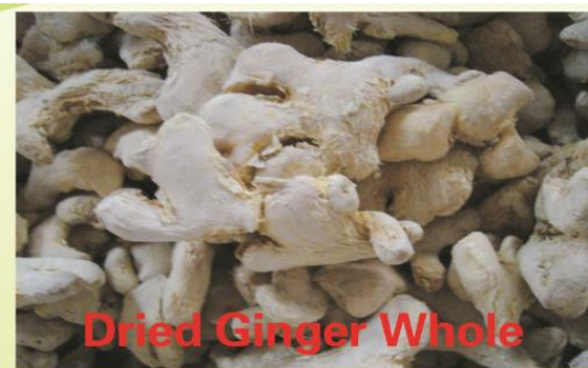
Dried Ginger Whole