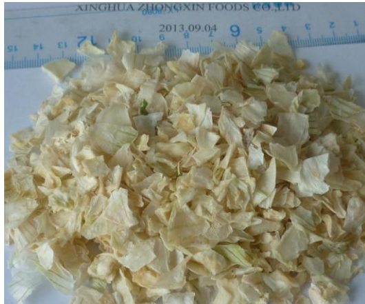
WHITE ONION KIBBLED 1-3 MM