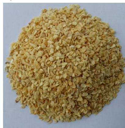
Chopped Garlic 5-8Mesh