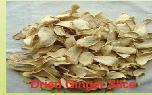
Dried Ginger Slice