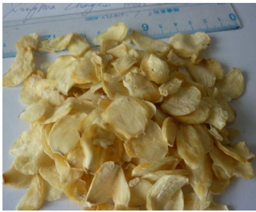
GARLIC GRANULES 8-16