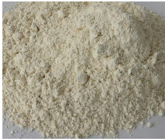
Garlic Powder 100Mesh