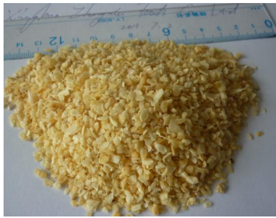
GARLIC GRANULES 16-26