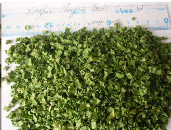
CHIVE FLAKES 5*5MM