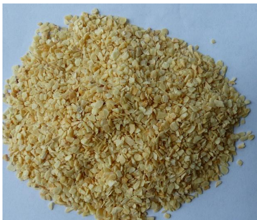
Minced Garlic 8-16Mesh