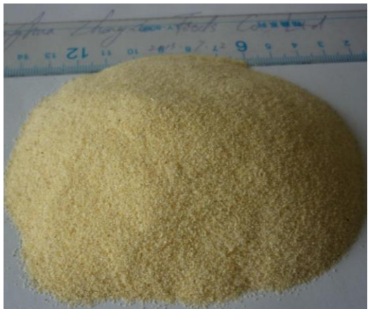
WHITE ONION 10*10 MM