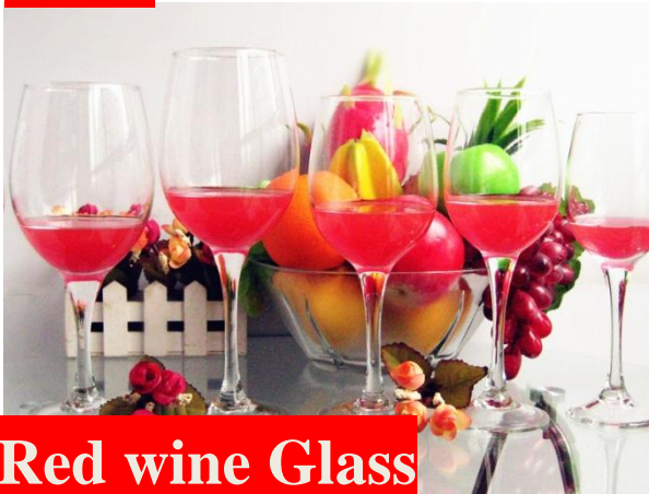
Red wine Glass