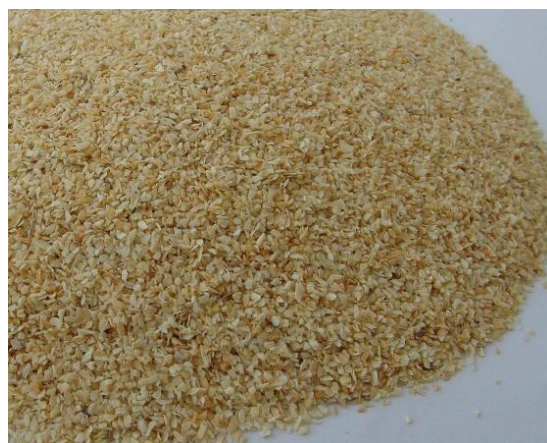
Ground Garlic 16-26Mesh