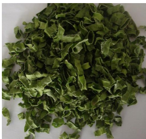
CHIVE ROLLS 3*3