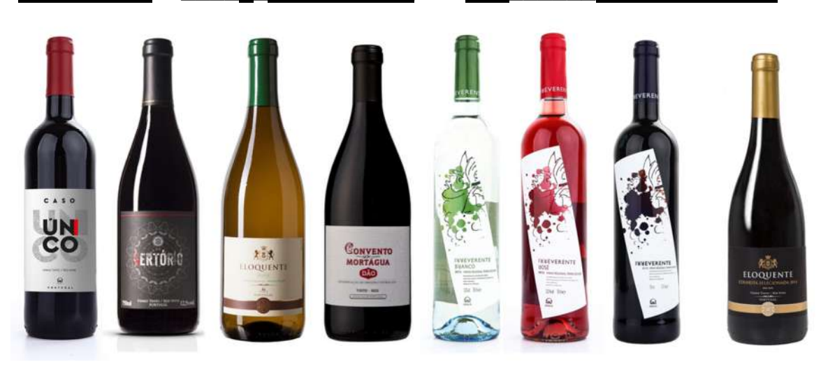
Table wine ____IGP_____ DOC ____